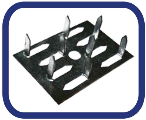
MetroFlex Acoustic Panel Impaling Clip

MetroFlex Acoustic Panel Impaling Clips are designed to make fastening Acoustic Panels to walls fast and easy. MetroFlex Impaling Clips are made of galvanized steel and contain 8 impaler spikes per clip. The impaling clips are designed to work with both Fiberglass and Mineral Fiber Panels with densities from 3# up to 8# (per cubic foot).