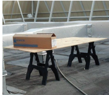
PRO TIP: As a work table, we recommend a 4' x 8' sheet of plywood with two saw horses, as demonstrated above.