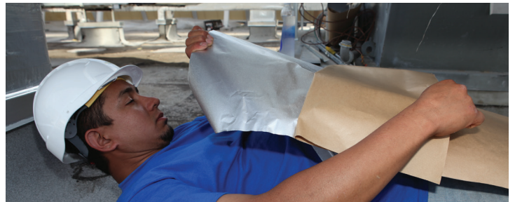
Peel back the width of your lap by a few inches, keeping the material as straight as possible as you begin installing.