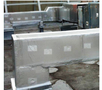
To cover washers, cut out squares of 777 at approx 6". Adhere the patches over the washers. Squeegee in place.