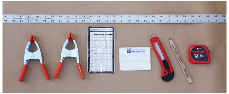
The Ideal Seal ® 777 "Shop in a Box" comes with everything you need to dispense, measure, cut, and install.

See reverse side for our 10 YEAR LIMITED WARRANTY 06/2015