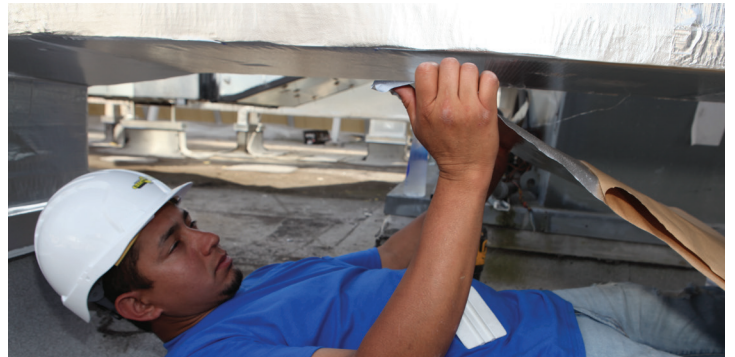
Use the provided squeegee to rub down the lap as you proceed. Pull the paper back as you come across the bottom of the duct work, smoothing out the material as you apply.

SCAN THE QR CODE BELOW TO WATCH OUR JACKETING INSTALLATION VIDEO